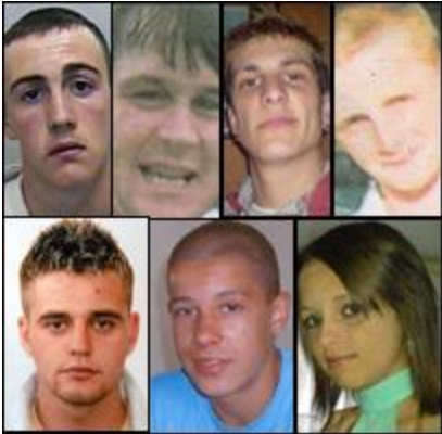
Figure 1: First 7 Violent Deaths

http://antidepaware.co.uk/bridgend-the-antidepressant-factor/